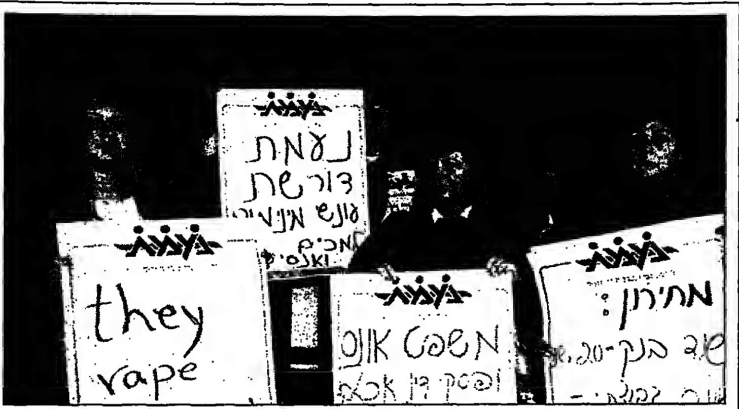
No justice, no peace Women hold a protest vigil in front of a Tel Aviv courthouse yesterday, part of a national campaign organized by the Na'amat women's organization at courthouses across the country. The organization is demanding an increase in the minimum sentences for sexual and family violence crimes.